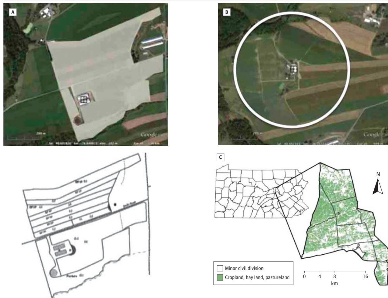
Figure 2. Three Methods Used to Identify and Locate Crop Fields

A, Aerial photograph (top) or map (bottom) were located using Google Earth ( n = 135 ). B, Operation addresses known and located using ArcGIS, version 10 (Esri) ( n = 420 ). C, County and township known and addresses were located by identifying cropland, hay land, and pastureland on a land use map and randomly selecting a point within the eligible land use types ( n = 131 ).